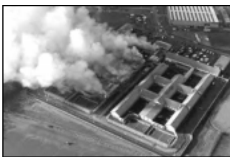
Yarl's Wood detention centre left in flames

Yarl's Wood is the latest botched attempt by the government to solve its refugee problem. A category B prison, surrounded by a 2 1/2 m high razor sharp fence (topped by 3 lines of barbed wire just in