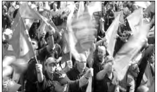
Firefighters overwhelmingly support strike action

How this growth in militancy develops will depend upon the workers' ability to form direct links with other workers in struggle and their autonomous organisation that operates according to their agenda not those of a union bureaucrat. We saw recently in the Edinburgh bus drivers dispute ( see Ar-A-