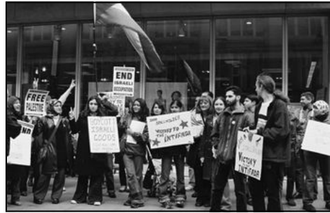
Picket in Manchester