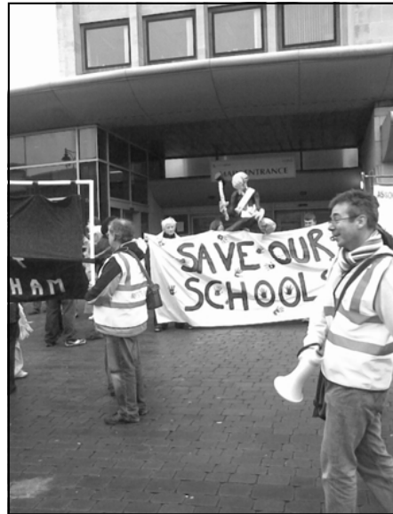
Oldham demonstration against academy schools

Councils across Greater Manchester want to close working class schools and re-open them as Academies. They already exist in Manchester and Salford, now Tameside and Oldham want to get in on the act.